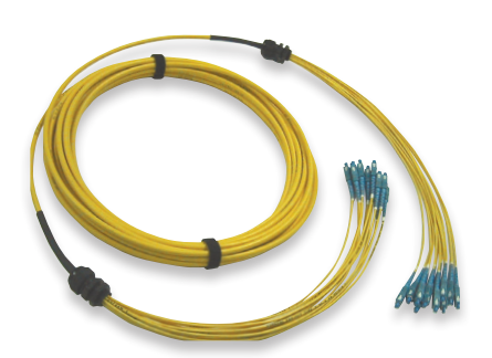
RUF1SCSC20M-12-3581 SC — SC 12 fibre singlemode pre-terminated riser cable 20 m, 500 mm breakouts with 3 mm yellow zero fibre oversleeving both ends, cable glands both ends