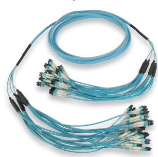
RMB4LCLC5M-48-3H11 LC-LC 48 F OM4 pre-terminated bundled round mini 5 m, 500 mm breakouts with 2 mm duplex zero fibre oversleeving both ends.