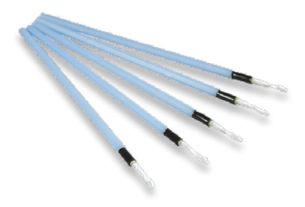
Type 1.25 mm