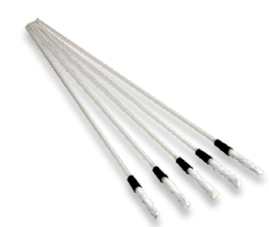
Type 2.5 mm