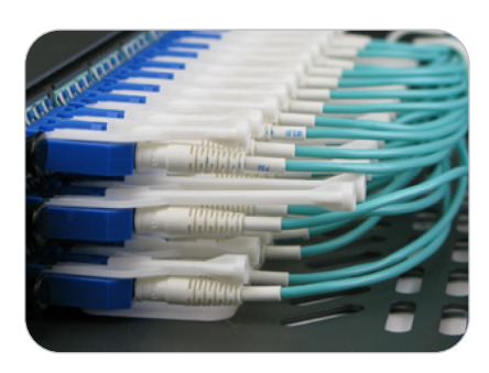
LC uniboot patch leads allow maximum access to the patching environment.