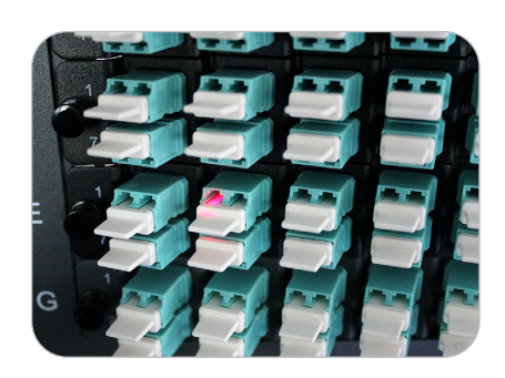
All AFL LC Duplex cassettes feature finger friendly, VFL traceable dust-caps