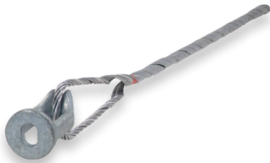
ADELD2E-424005TE * shown with optional thimble eye