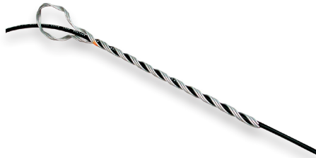
ADESDFW2-256 and 307