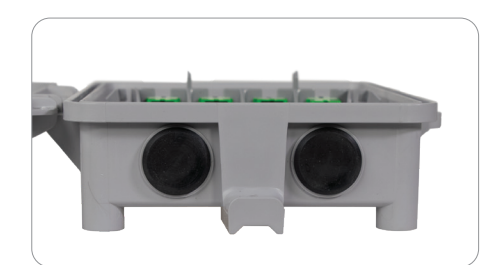
1/2" Hole Entry Option