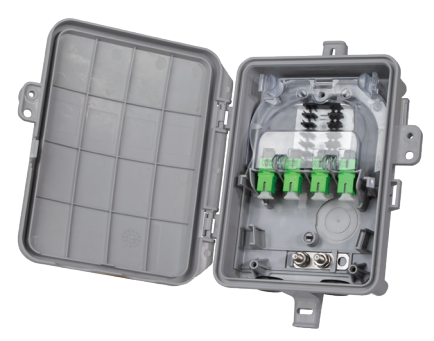
Shown with four SC/APC adapters, security cover and grounding