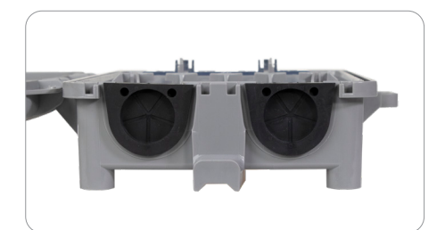
"U-Grommet" Entry Option