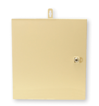
144 Fiber (Closed)