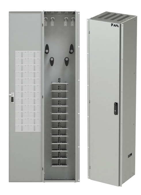
UHFC MPO Patch Frame