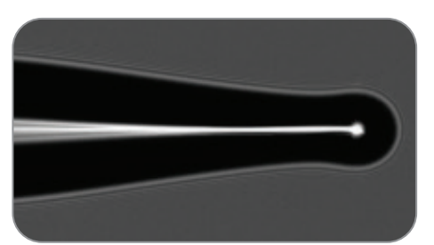
Tapered Probe with Small Ball End