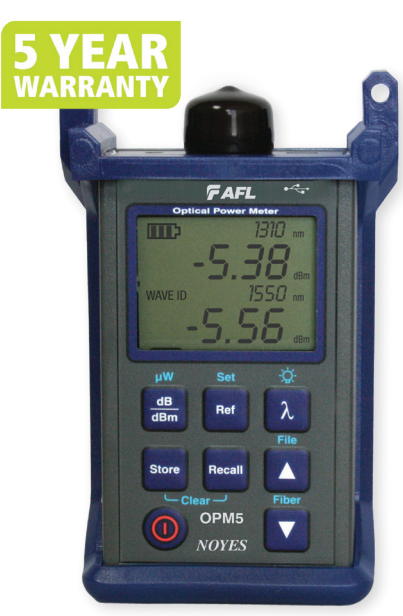
OPM5 Optical Power Meter