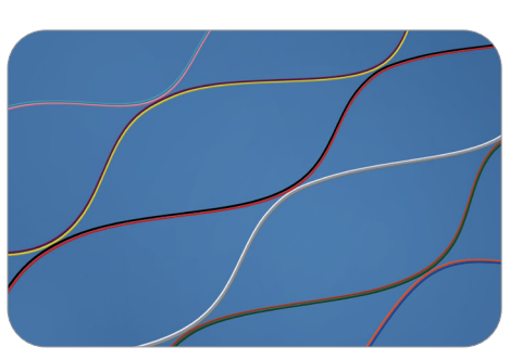
SpiderWeb Ribbon Technology