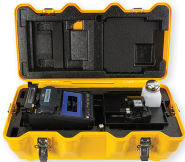
Workstation in Transit Case