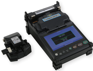
22S (with Cleaver for scale)