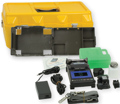
Fujikura 22S Kit 1