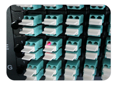
All AFL LC Duplex cassettes feature finger friendly, VFL traceable dust-caps