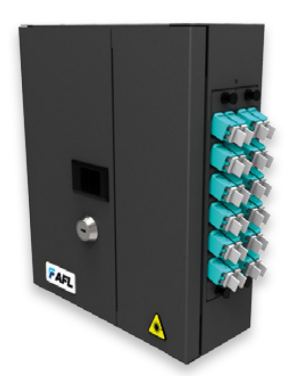
AFL's SD MTP Cassettes also suit a variety of FWE Wall Enclosures, allowing for high density patching and cross connect in a wider range of applications.