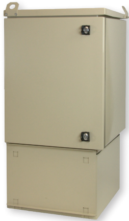
288 Fiber (Closed)