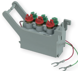
1-C-1 Module (Bunch Block)