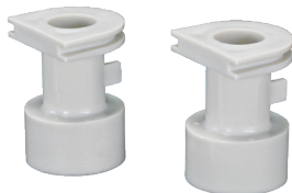
3/4" Pipe Fitting Transition Kit