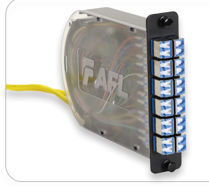
24-Fiber LC/UPC Configuration