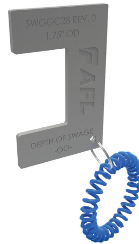
SWGGC INSPECTION GAUGE (PURCHASED SEPARATELY)