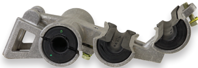
Double Trunnion Cable Support (open)