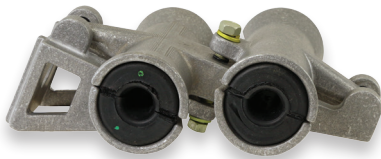
Double Trunnion Cable Support (closed)