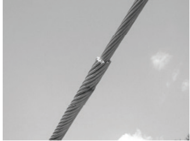
6. When complete, make sure the ends have been snapped into place.