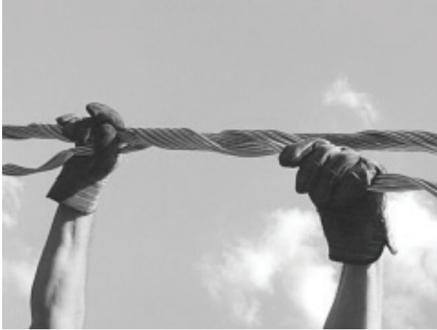
5. Repeat the procedure for the remaining subsets.