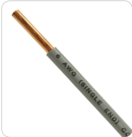
6 AWG Solid with grey PVC Jacket

Copperclad Steel Wire from AFL can be jacketed to further reduce copper theft and is available in black with green stripe or grey. Available sizes are shown in the chart below, Table 1. Please contact AFL for larger sizes not shown.