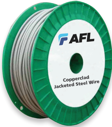
Spool of Copperclad Steel Wire with PVC jacketed material. For spool sizes and specifications, see page 14.