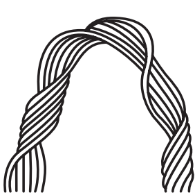
Open Helix Loop