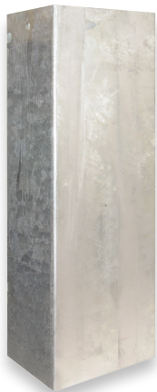
Opti-Guard Bullet Guard

The Opti-Guard Bullet Guard is designed to supplement the ballistic resistance of the Opti-Guard Splice Enclosure.