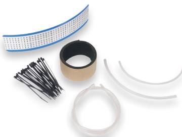
Opti-Guard Fiber Routing Kit

The Opti-Guard Fiber Routing Kit provides all of the materials to properly route fibers from a stainless steel tube to the OGST01-72 splice tray inside the Opti-Guard splice enclosure.