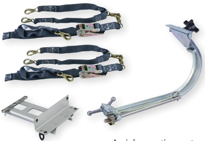
Aerial mounting system