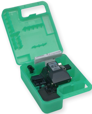
Shown in CC-21 Carrying Case