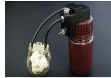
Spare Pump for quickly changing UV resin type: FSR-05-pump-01