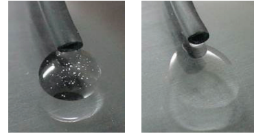
Bubble Separator Performance