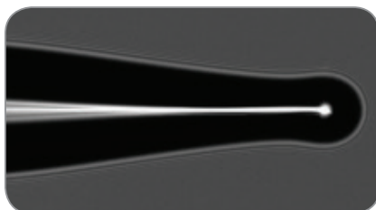
Tapered Probe with Small Ball End