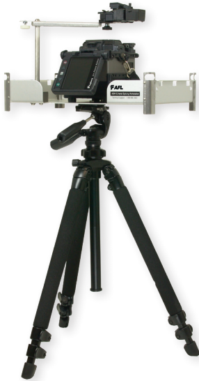
Portable Tripod Workstation Kit (splicer and cleaver not included)