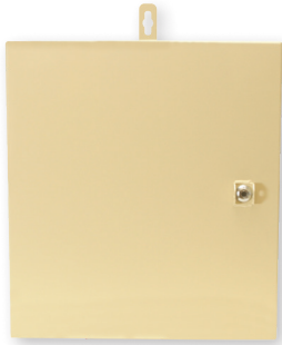
144 Fiber (Closed)