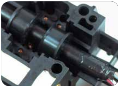
Multiple layers of sealing protection