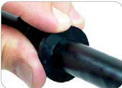
Ease of installation (no tapes, washers, or glue)