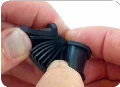
Expandable to support various cable diameters