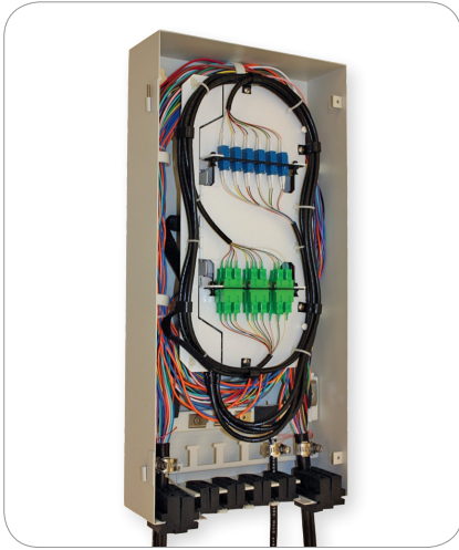
LL-400b shown with optional interconnect module