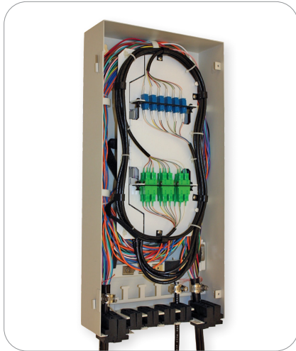
LL-400b shown with optional interconnect module