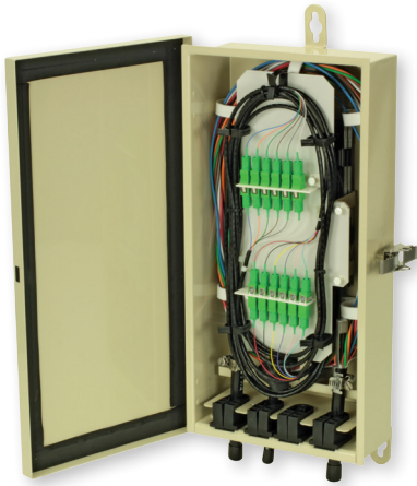
LL-500 with interconnect kit installed