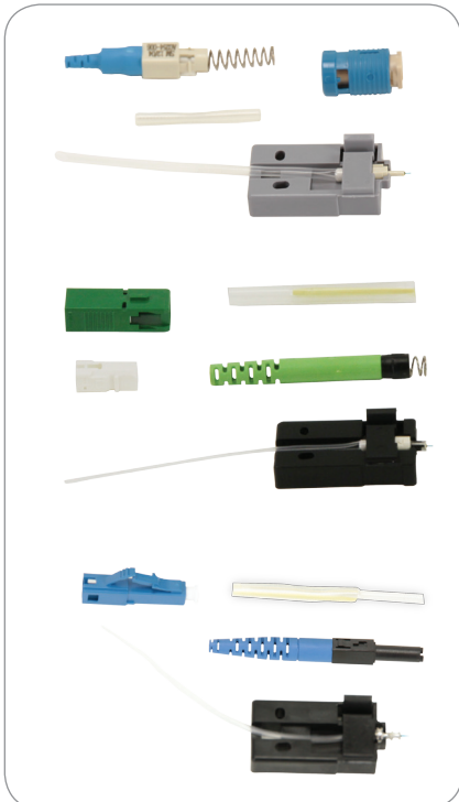
FUSEConnect Kits—ST (blue), SC (green), LC (blue)