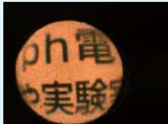
Actual image taken by plastic image fiber