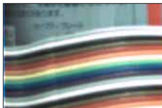
Pictures Taken by 29K Pixel CMOS Module